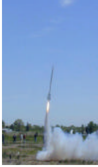
J90 powered rocket at liftoff