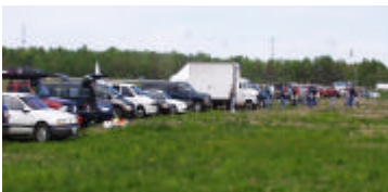
Amherst, Ohio Launch site